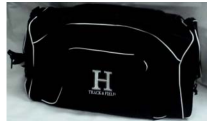
Hillsdale T&F Black Equipment Bag $50

To place your order, please see the order form on page 8.