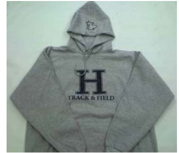
Gray Sweatshirt $35