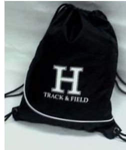
Hillsdale T&F Black Shoe/Spike Bag