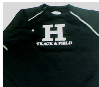
Dri-Fit Navy T-Shirt $30 (Also in White, Black)