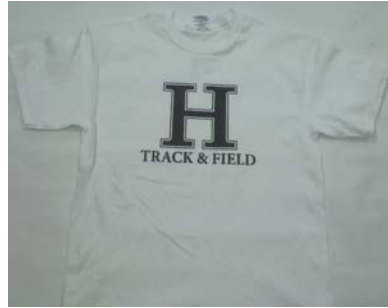
White T-Shirt $12