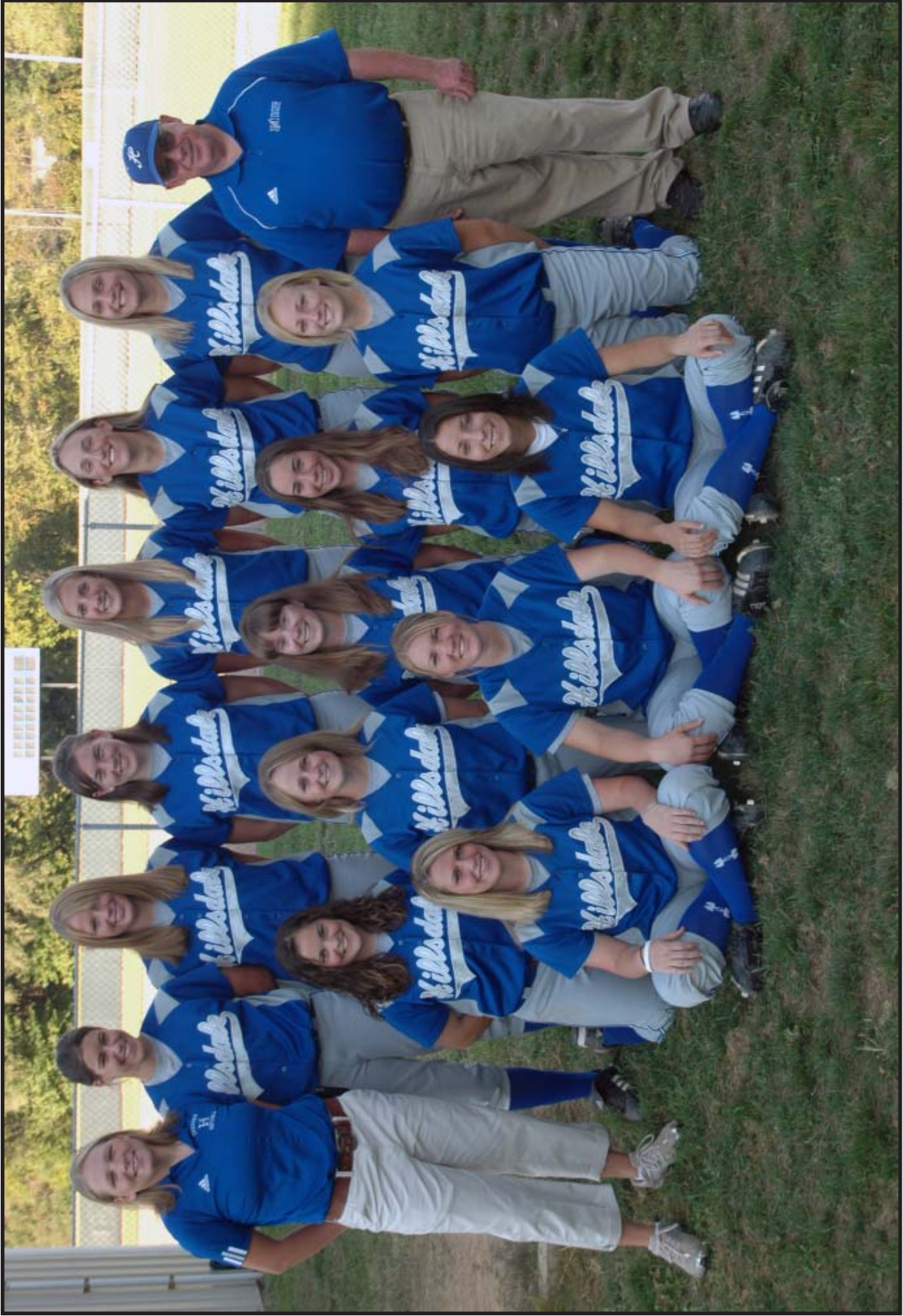
The 2008 Hillsdale College Softball Team.