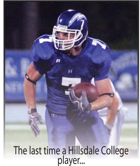
The last time a Hillsdale College player...